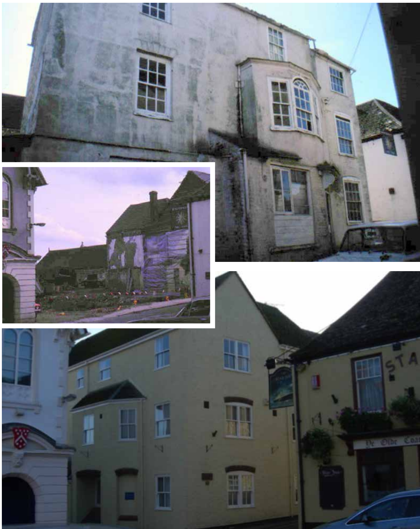
The Crown 1978, demolished 1979 & rebuilt as Crown House